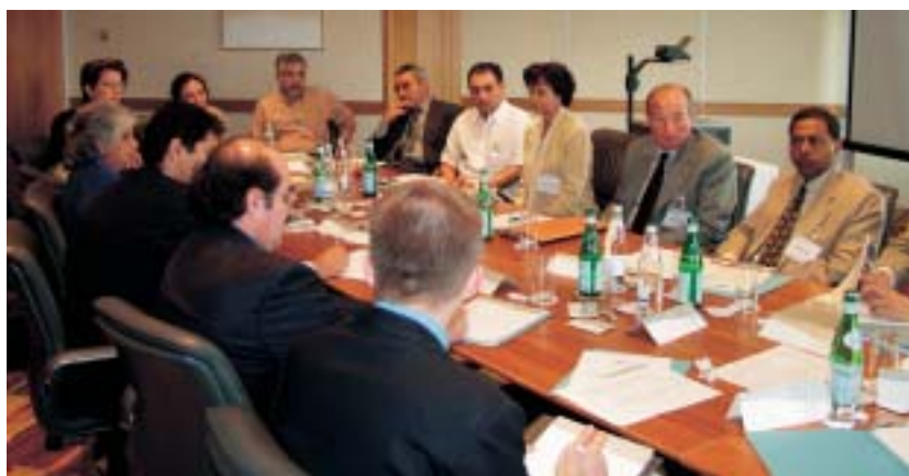
Several strategy groups met immediately before or during the Annual Meeting. Shown here, the Breast Cancer Strategy Group.

Several strategy groups met to discuss ongoing or future activities. Strategy groups are comprised of cancer specialists from developing countries and facilitators from INCTR and Associate Member organizations. Invited experts may also attend. Strategy groups have a disease specific focus, and encompass epidemiology, prevention, early detection and treatment. On the day prior to the meeting, the Leukemia Strategy Group, Cervical Cancer and Breast Cancer Strategy Groups met. Both of the latter, being newly formed, held free-ranging discussions which led to the identification of a number of potential areas for collaboration among the participants. From these, feasible ar-