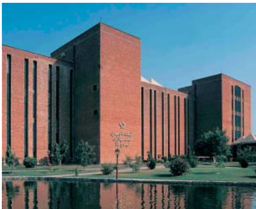
A new hospital and cancer research center in Lahore, Pakistan, was built with private funds and collaboration between medical personnel in Pakistan, Britain and the USA.