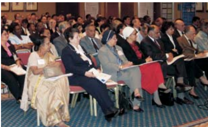
Two "firsts" for this year's Annual Meeting were the Award Lectures and a poster session. Shown here, the audience at the well-attended award ceremony.

advice whenever needed. For this reason, INCTR has established a Special Panel of its Advisory Board to provide advice regarding its programs and projects, including the choice of topics for INCTR's Annual Meeting, and the selection of INCTR special award winners. The Panel met for the first time during the meeting and a number of decisions were made regarding its scope and modus operandi . The Panel will assemble every year at the Annual Meeting, but will also give advice throughout the year via e mail or fax communications.