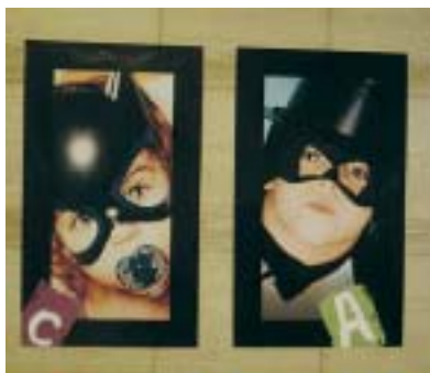
Un cartel utilizado en Brasil para informar a padres acerca del "ojo de gato."

pacientes en estadios no avanzados (incluso pacientes con extensiones de tumor en las láminas del ojo profundo a la retina) sólo con vigilancia oncológica, es decir, sin quimioterapia, con un índice de recaída de 2 de los 50 casos evaluados. Hace 2 años iniciamos el salvamento de ojos que al diagnóstico fueran susceptibles de llevarlo a cabo. Iniciaron con esquema de Carboplatin/VP16 o Carboplatin monodroga más terapia local (radioterapia o laser). Los resultados son preliminares; sin embargo, nuestro índice de éxito está alrededor de un 50%.